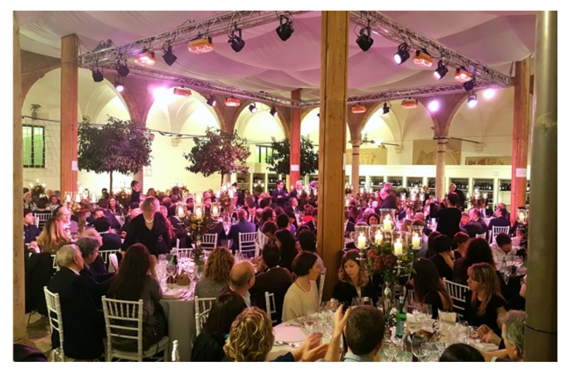
(https://vintagedirect.files.wordpress.com/2017/06/benvenuto-brunello-gala-dinner.jpg) Benvenuto Brunello gala dinner

Only 15 per cent of a surface area totalling 24,000 hectares is planted to vines, just under 60 per cent to Brunello, approximately 15 to each Rosso and Sant'Antimo, 1.5 to Moscadello and 10 per cent to other grape varieties. The vineyards are set in a charmed square amphitheatre of geology, with the 1,740m high Mount Amiata to the south acting as protector and climate mitigator. Soils vary but at its most beautiful the decomposition of quatenary rock gives way to marl and albarese. The area is blessed with a Mediterranean climate, thankfully free of frost, great temperature fluctuations, the disease combative frequent presence of wind, mild and full days and in the end long, phenolic developing growing cycles.