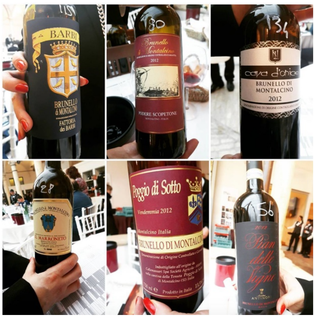
(https://vintagedirect.files.wordpress.com/2017/06/eyes-on-annata-2012-consbrunellobrunellodimontalcino-benvenutobrunello-2017-montalcino-toscana.jpg) Eyes on annata 2012 @consBrunello #brunellodimontalcino #benvenutobrunello 2017 #montalcino #toscana