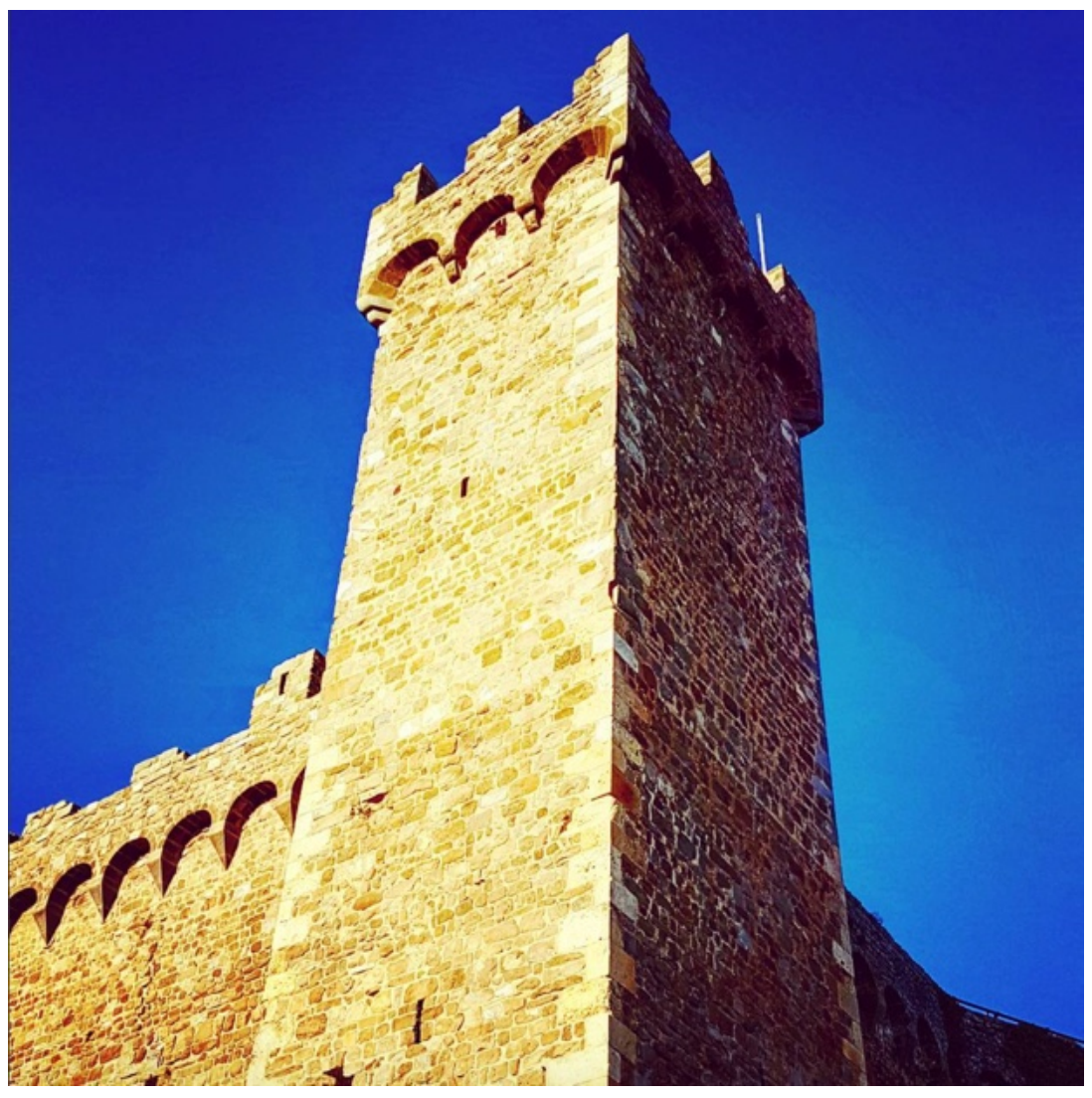
(https://vintagedirect.files.wordpress.com/2017/06/buongiorno-montalcino.jpg) Buongiorno #montalcino La Fortezza di Montalcino

The Brunello vintage at the 2017 Anteprima is the one that growers, producers, marketers and critics will chime in with a wide variance of opinion. There are many ways to look at the 2012 growing season. It is prescribed as a five-star vintage by the Consorzio, putting it on par with the best of the last 20 years, including 2010, 2007, 2006, 2004 and 1997. Critics remain skeptical and producers seem content to say "we'll see," knowing that structure is a guarantee but that fruit may peak early. There is little doubt that fruit quality is prodigious to say the least and that to a wine, these are fine and refined sangiovese. The producers who resisted temptation to make huge wines and the ones who took a step away from the machine will likely be the ones who found the best balance and in turn will have forged the longest aged Brunelli. I for one see 2012 as closer to 2008 and 1998, firm, a little misunderstood in the early days and capable of improving dramatically with five to seven years of age. The fruit just seems to speak this truth.